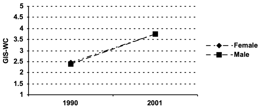
Figure 2. Female and Male Gender Ideology Regarding Women Participating In the Church by Cohort Year

[14] As can be seen in Figure 2, there is no evidence that subjects in the 1990 and 2001 cohorts differ in regard to their view of women participating in the church along gendered lines ( F [1, 1135] = .22, p = .64 ). A Two-Way ANOVA reveals main effect increases between 1990 and 2001 CT readers for both genders, indicating that CT readers in 2001 affirm more conservative attitudes on women participating in the church than those in 1990 ( F [1, 1135] = 369.39, p = .00 ). There is no evidence that males hold more patriarchal gender role attitudes than females ( F [1, 1135] = .18, p = .67 ).